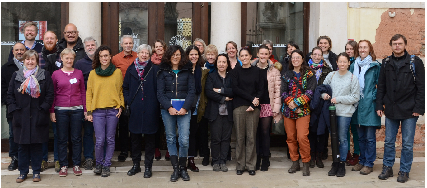
Goby researchers outside the Palazzo Grassi in Chioggia, Italy.