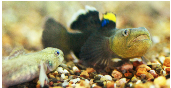
Desert goby female and male during courtship

After the keynote followed many interesting talks on goby behaviour including very recent results from a